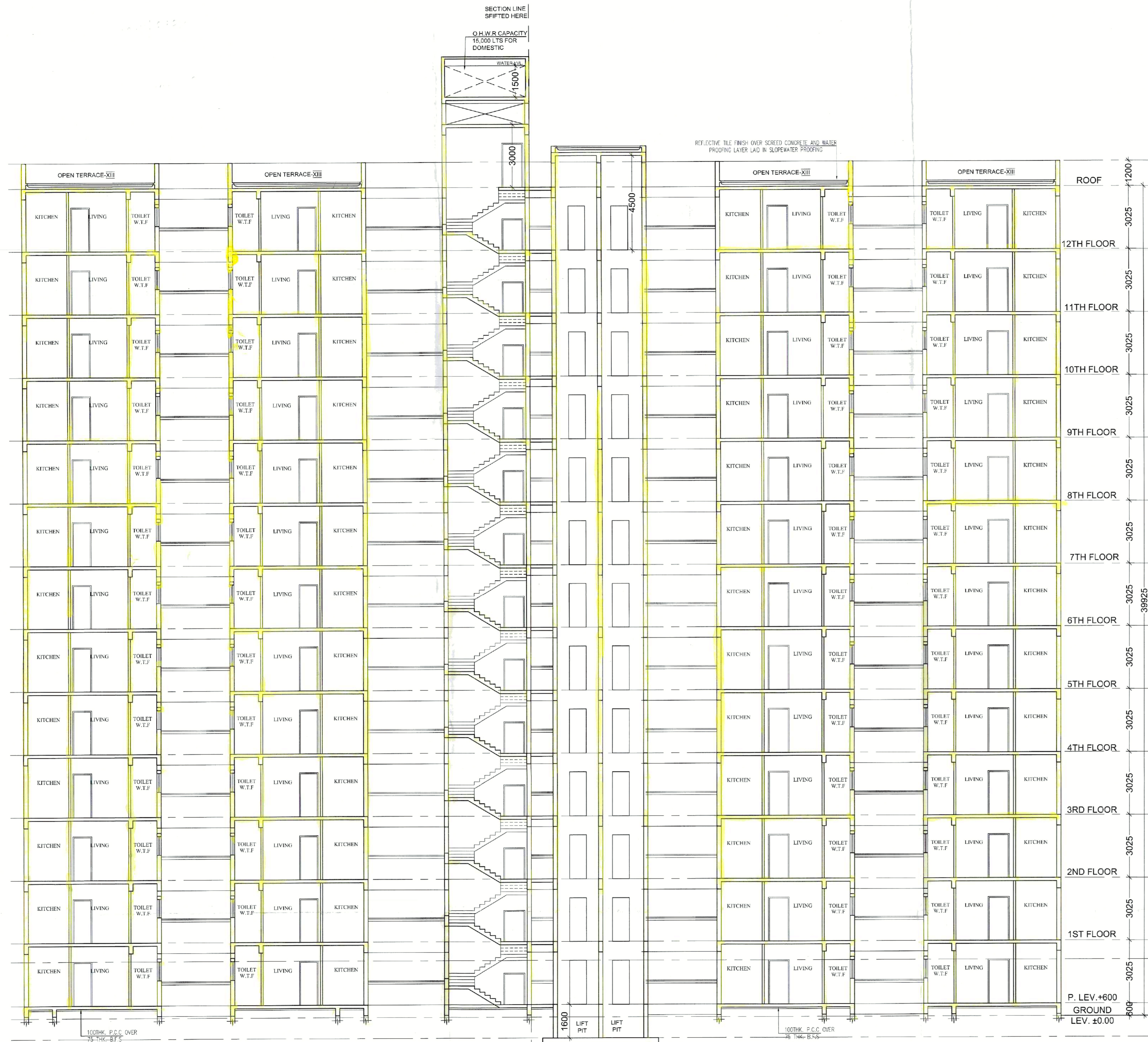
SECTION THROUGH A-A TOWER-4